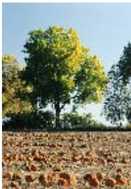
Cover Photo: Pumpkin Patch in October, Photo by © Ronald L. Holle, used with permission.

If you have a photo or slide that you would like considered for the cover of Colorado Climate , please submit it to the address at right. Enclose a note describing the contents and circumstances including location and date it was taken. Digital photographs can also be considered. Submit digital imagery via attached files to: odie@atmos.colostate.edu . Unless otherwise arranged in advanced, photos cannot be returned.